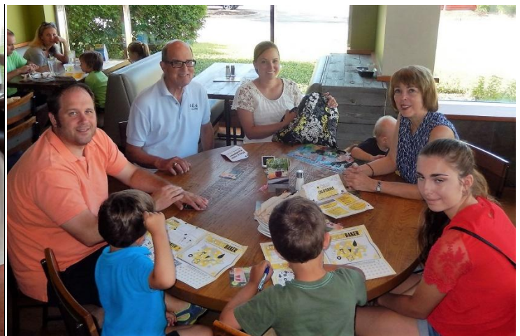
The Wroblewski Family